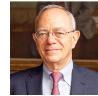
ENVIRONMENT L. Rafael Reif and the MIT Sustainability Team